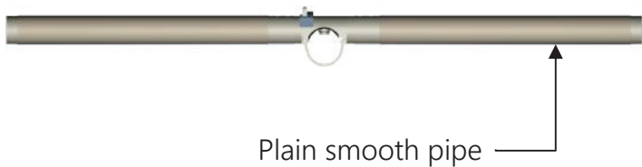
Old Style Tube Diffuser

Operation of the diffuser in an ON / OFF airflow application may cause a fold on the membrane. Overtime this fold causes a weak point.